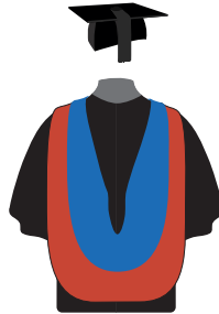
Pearson BTEC, EdExcel, HNC, HND and all other awards