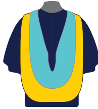
Open University Bachelor