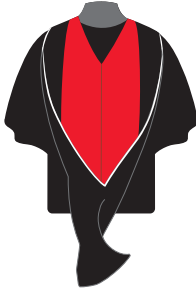
ILM All Levels