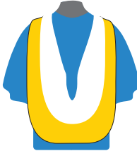
Open University Master