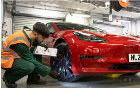
Electric and Hybrid Motor Vehicle Workshop

We are always developing our campus and facilities to support the growth of skills in the Tees Valley.