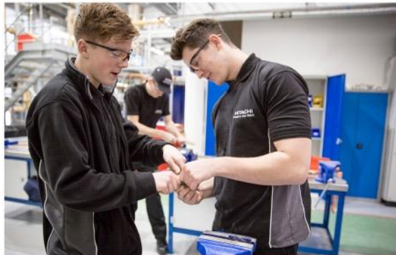
7 classrooms and workspaces for Construction, Engineering and TTE