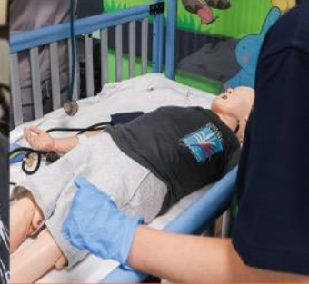
Health and Care Ward