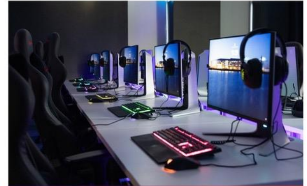
Brand-new Esports room