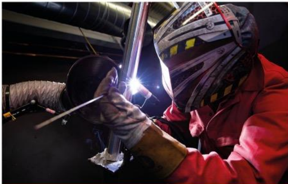
Specialised Welding equipment to meet industry needs