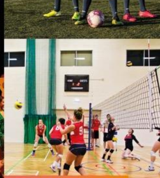
Sports Hall and Astroturf pitches