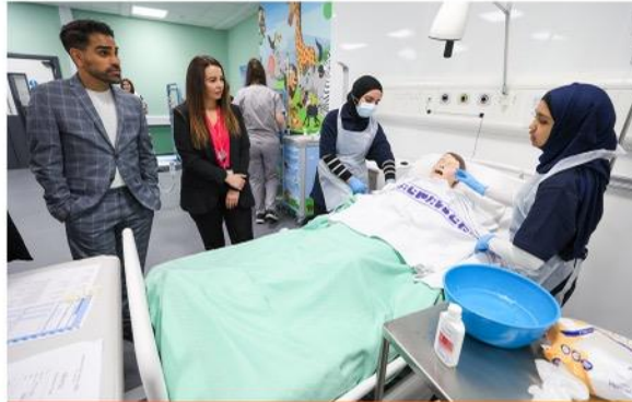
State-of-the-art Clinical and Community Care Simulation Suite for Health & Care programmes