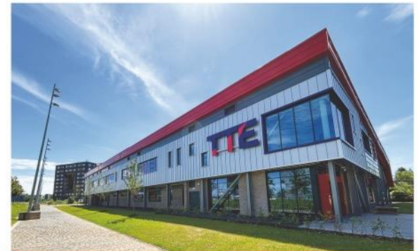
State-of-the-art £12m Engineering Technical Training Centre