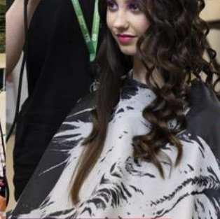
Hair and Beauty Salons