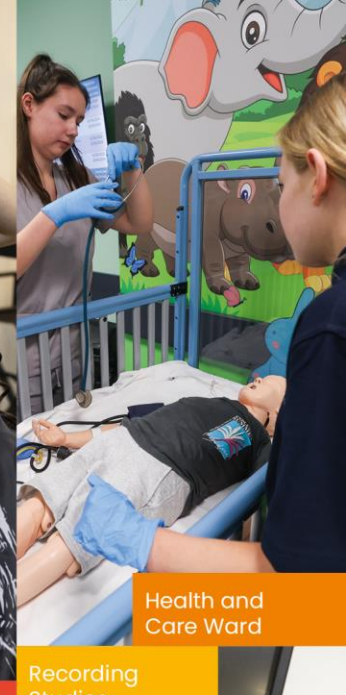
Health and Care Ward