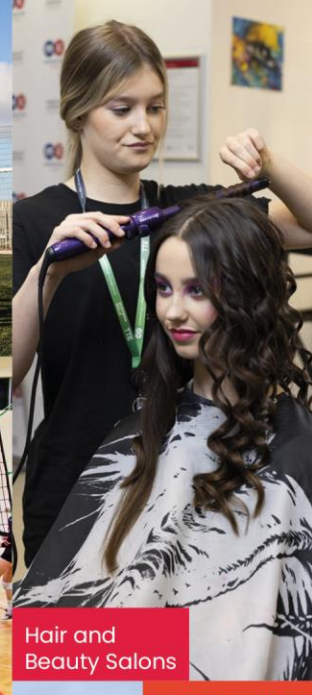
Hair and Beauty Salons