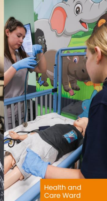
Health and Care Ward