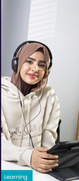
Learning Resource Centre

We are also extremely proud of our innovative industry-standard facilities that give you everything you need to succeed!