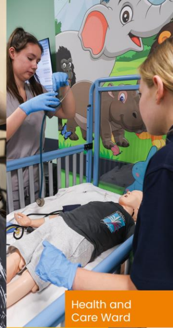
Health and Care Ward