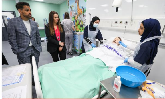
State-of-the-art Clinical and Community Care Simulation Suite for Health & Care programmes