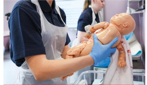
Range of interactive Health & Care medical equipment