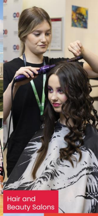
Hair and Beauty Salons