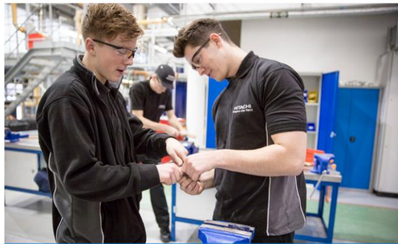
7 new classrooms and works spaces for Construction, Engineering and TTE