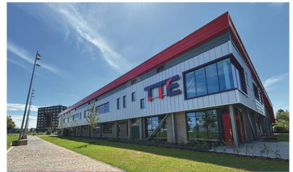
New state-of-the-art £12m Engineering Technical Training Centre is now open!