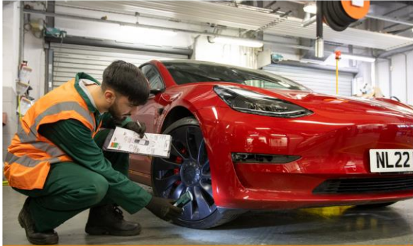
Electric and Hybrid Motor Vehicle Workshop

We are delighted to be developing our campus and facilities to support the growth of skills in the Tees Valley. Ready for September 2024.