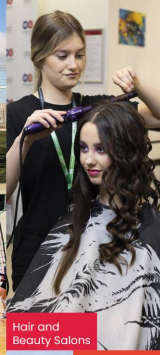
Hair and Beauty Salons