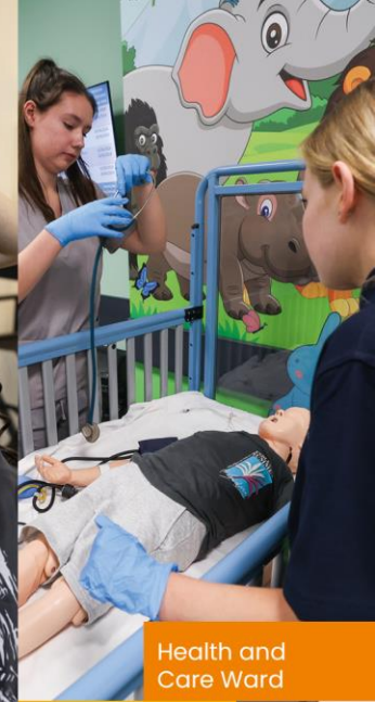
Health and Care Ward