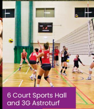
6 Court Sports Hall and 3G AstroTurf