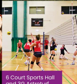
6 Court Sports Hall and 3G AstroTurf