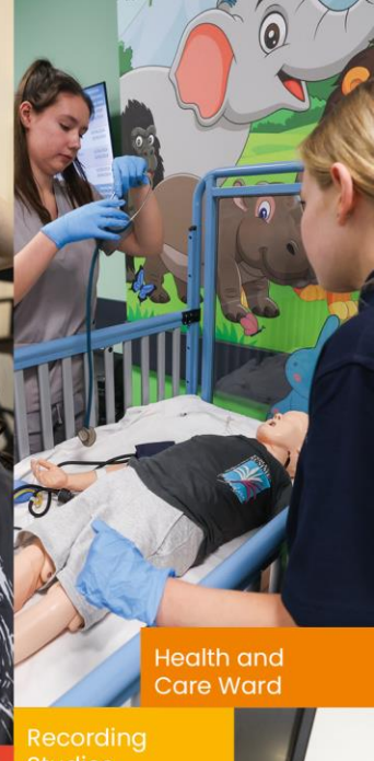
Health and Care Ward