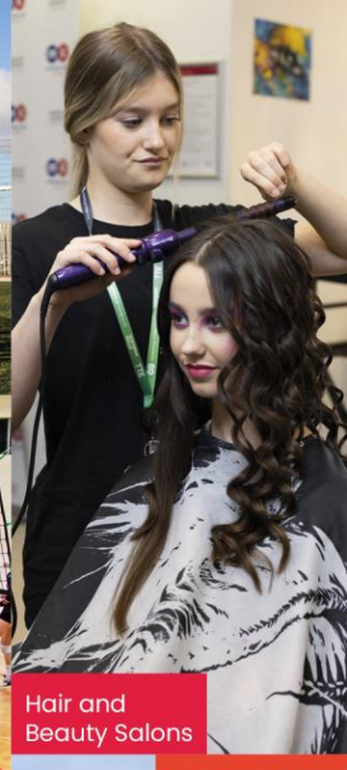
Hair and Beauty Salons