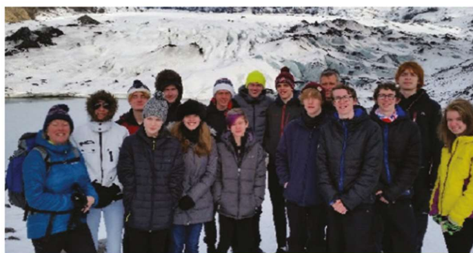
Geography residential fieldtrip to Iceland

Students are required to complete a minimum of four days work in the field to develop field observation and data collection skills. In the last 3 years students have visited these locations: Staithes and Whitby, The Lake District Skiddaw, Eden Valley and Mardale.